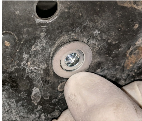
FIGURE 3 - WASHER POSITIONING FOR LOCATION A, B & D

Thank you for choosing ADF Customs! We appreciate your business. Should you have any questions, issues or feedback, please email us at: info@adfcustoms.com