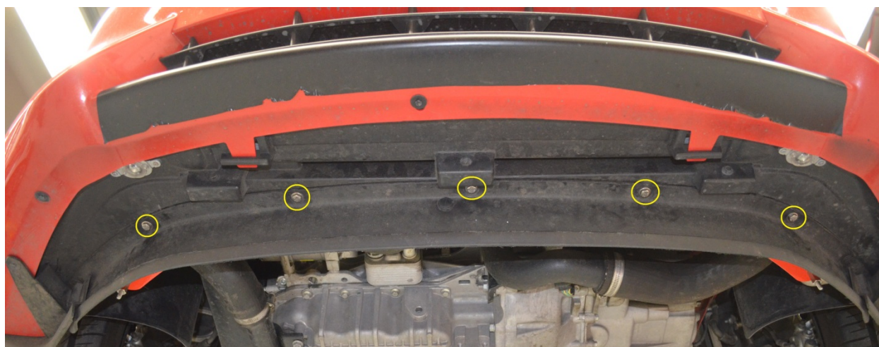
FIGURE 2 - PUSH PIN LOCATIONS