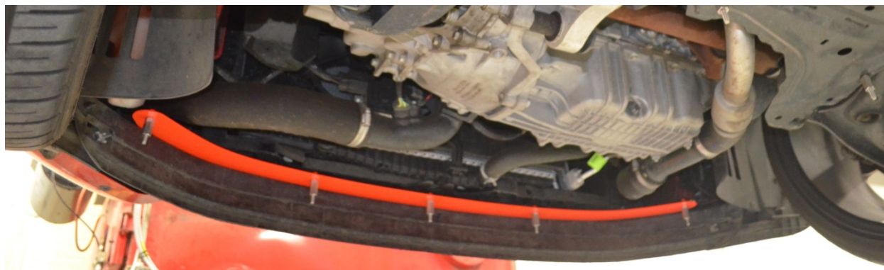
FIGURE 3 - INSTALLED MOUNTING BRACKET